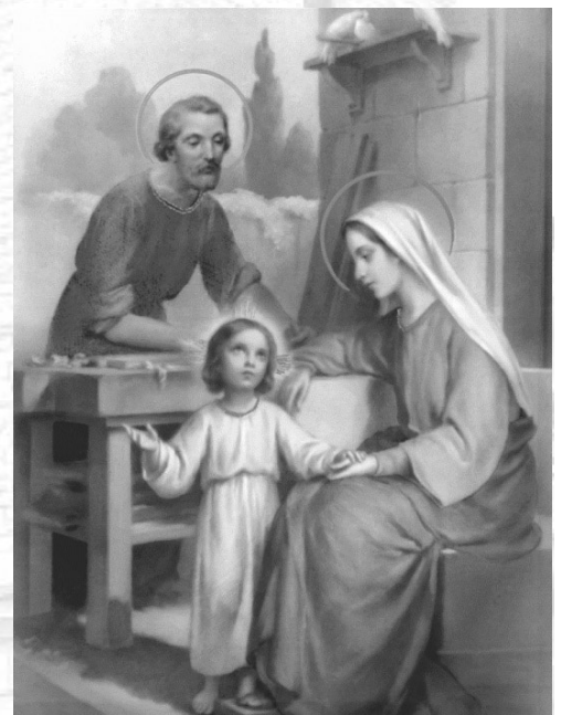
"The Family That Prays Together Stays Together" - Fr. Patrick Peyton, CSC